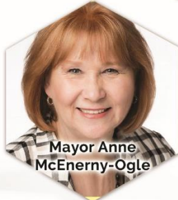
Mayor Anne McEnerny-Ogle